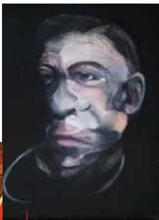
1990, Francis Bacon, Portrait of Jacques Dupin