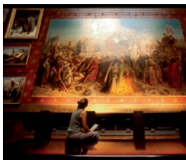
The Museum Grand Salon

• Jules Verne's House 2, rue Charles-Dubois Tel. : +33 (0)3 22 45 45 75 www.amiens.fr/ maisonjulesverne